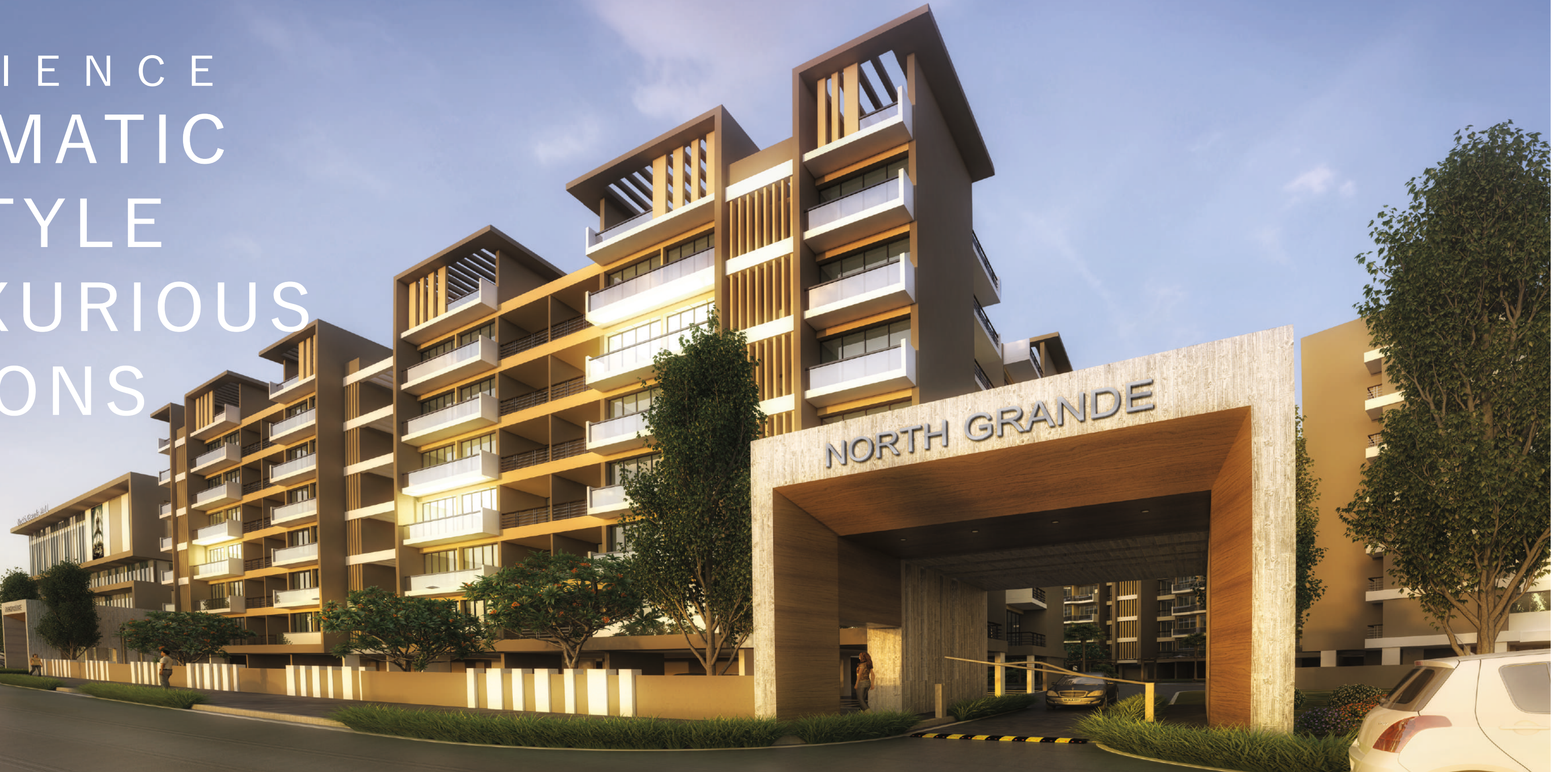
Grand entrance view as per plan

EXPERIENCE A THEMATIC LIFESTYLE IN LUXURIOUS ENVIRONS